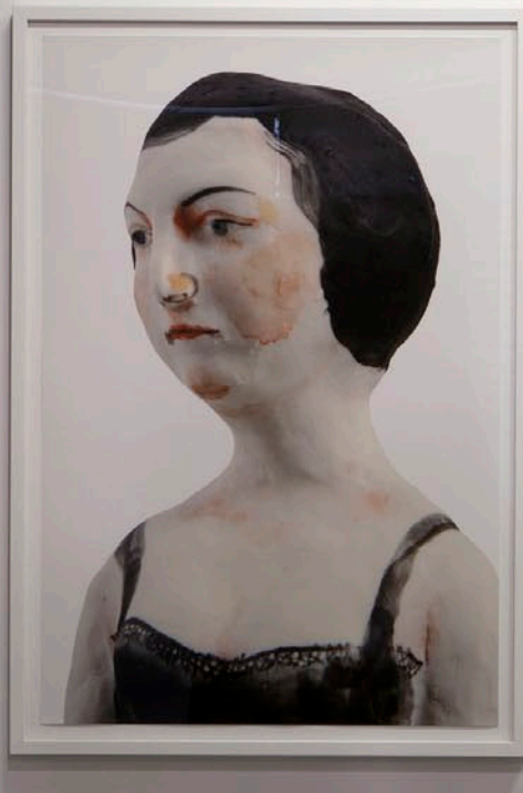
Below: Akio Takamori. Parisian Woman . 2012. Porcelain figure with underglazes, framed archival pigmented ink print on Hahnemuhle sugar cane paper. 15 x 4.5 x 4.5 and 36 x 23.5 in.