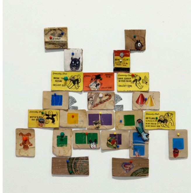
Facing page: Kate Gilmore. Sudden as a Massacre . 2011. Video looped with a one minute break in-between. 00:30:50 min. Courtesy of the artist. Monitor courtesy of Brand 10 Art Space. Above left: Thomas Müller. Boy . 2010. Clay, glaze and unfired porcelain. 36 x 36 x 5 in. Courtesy of the artist. Above right: Kristen Morgin. Space Invader . 2012. Unfired clay, paint, ink, marker, wire, thumbtack and graphite. 14 x 16 x .5 in. Courtesy of the artist.

subversive strategies in their work. Ben Brandt, Kate Gilmore and Thomas Muller engage in acts of destruction as a form of creation. Brandt's video Apoxyomenos II depicts an older man dressed in black briefs (whom Meehan describes as a hybrid Picasso/Richard Serra character) putting clay slip on the body of a younger man, also dressed in black briefs. The older man then squirts powdered pigment on the younger man. The younger man scrapes off the debris and then the two men wrestle. Inspired by the ancient Greek sculptures of Apoxyomenos (picture an idealised, nude, male athlete carved in marble) the video is absurd, yet filled with tender desire and sexual tension.